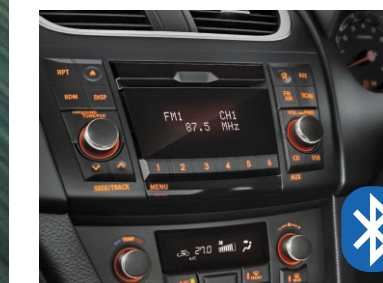
AUDIO SYSTEM WITH BLUETOOTH