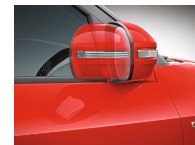
ELECTRIC RETRACTABLE ORVM WITH TURN INDICATORS