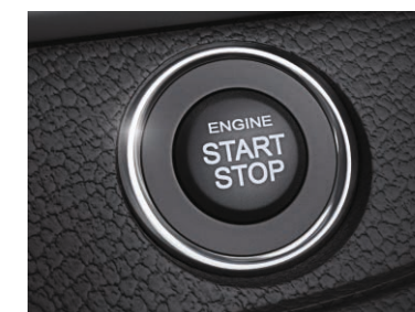
PUSH START BUTTON