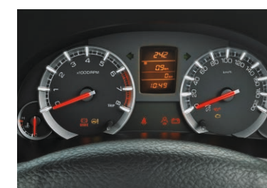
INSTRUMENT PANEL WITH MULTI-INFORMATION DISPLAY