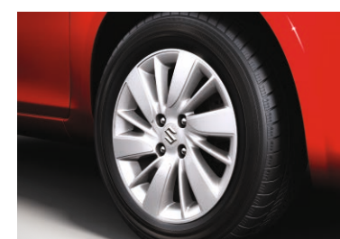
185/65 R15 ALLOY WHEELS