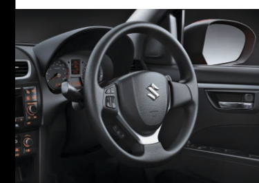
TILT STEERING & DRIVER SEAT HEIGHT ADJUSTMENT