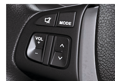
STEERING MOUNTED CONTROLS