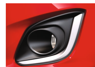
NEW FOG LAMP BEZEL (SILVER ACCENT)