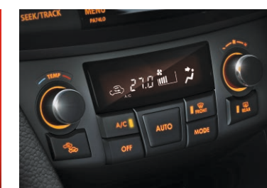
AUTOMATIC CLIMATE CONTROL