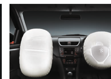
SUPERIOR DUAL SRS AIR BAGS