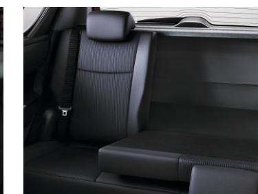
60:40 SPLIT SEATS